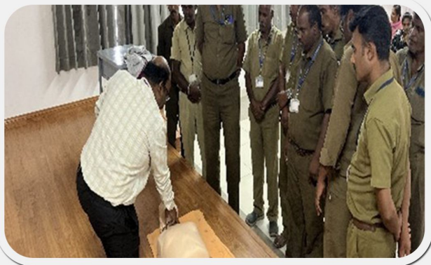
Demonstration of CPR